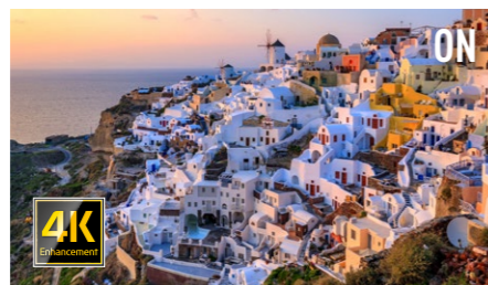
With 4K Enhancement Detailed and sharp

Using the innovative 4K-Enhancement Technology, each pixel is shifted diagonally by 0.5 pixels to double the resolution. Without compromising on the sharpness and clarity of your visuals, leave a memorable presentation with vibrant and engaging ultra-high-definition images.