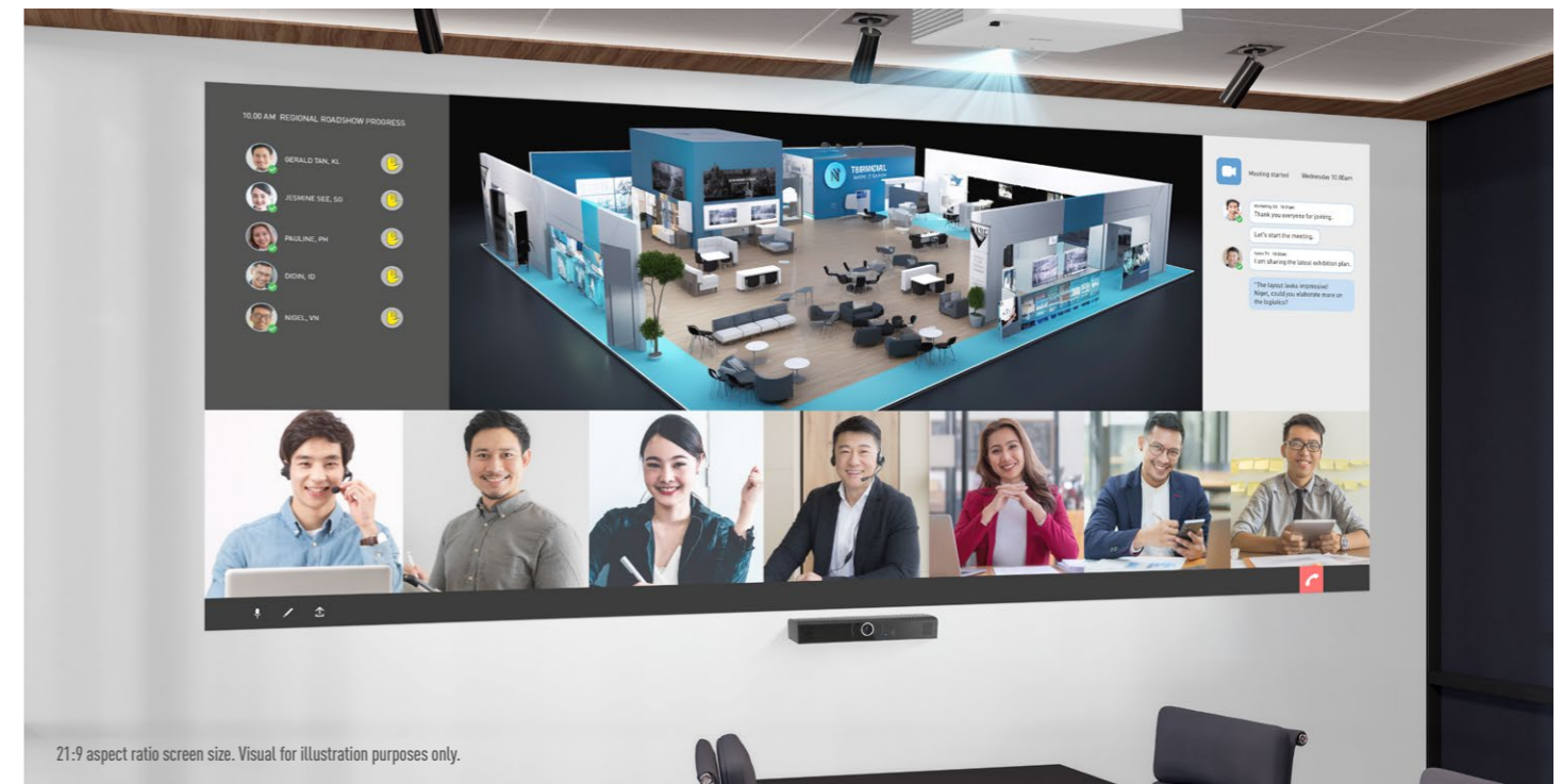
21:9 aspect ratio screen size. Visual for illustration purposes only.