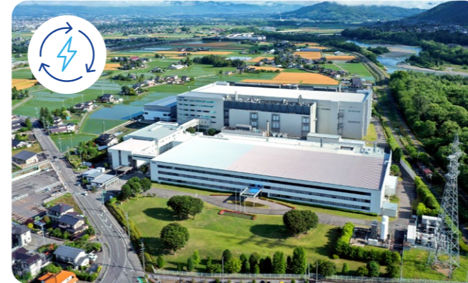
Toyoshina plant in Japan