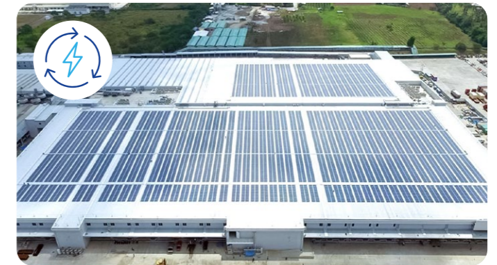
Epson Precision (Philippines), Inc.

Epson announced that its worldwide group sites 2 will all meet their electricity needs from 100% renewable energy sources (renewable electricity) by 2023. We have achieved 100% renewable energy at our projector's manufacturing site in the Philippines by generating power with a rooftop mega-solar power plant and by switching to a mix of geothermal and hydroelectric power in January 2021.