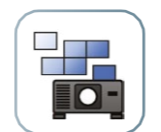
Epson Professional Tools