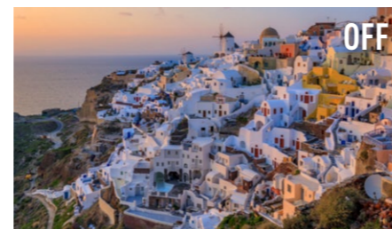
Without 4K Enhancement Loss of colours and details